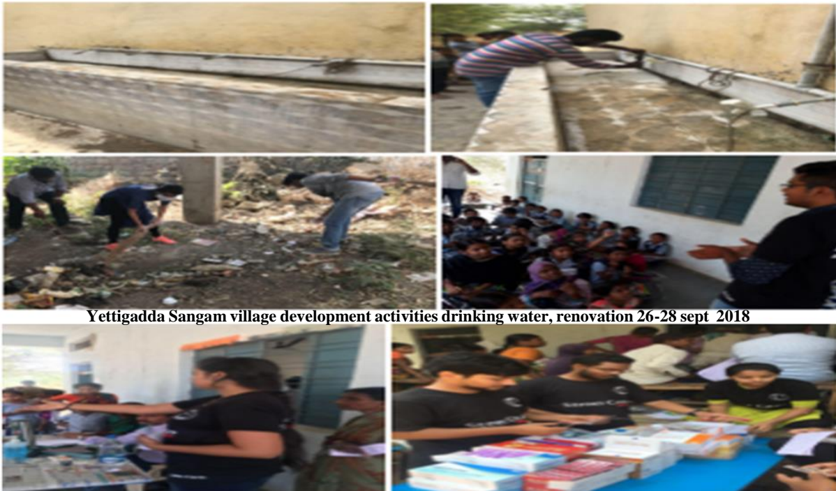
Yettigadda Sangam village development activities drinking water, renovation 26-28 sept 2018

8. Water supply connection was established to the government school and a medical camp was held for the villagers.