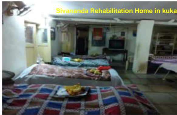
Sivananda Rehabilitation Home in kukatpally9th November 2014