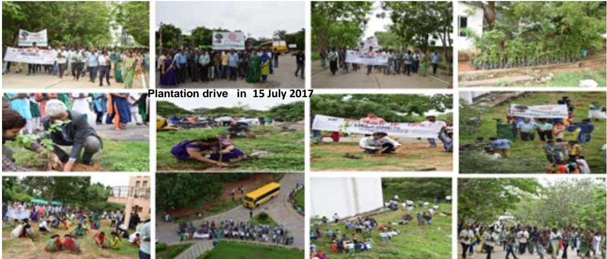
Plantation drive in 15 July 2017