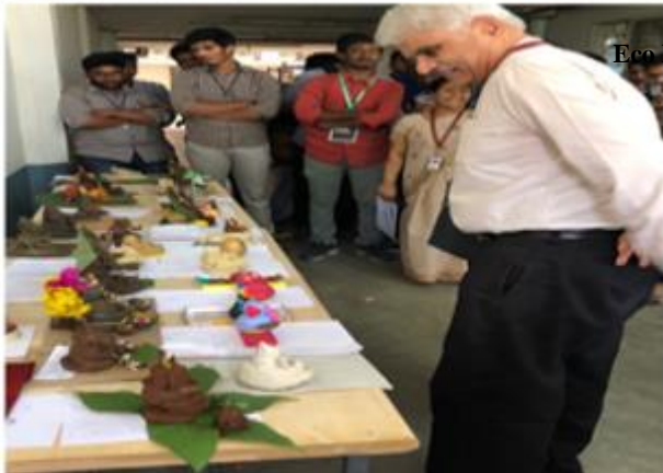
Eco-Friendly Ganesha competitions on 11 Sept 2018