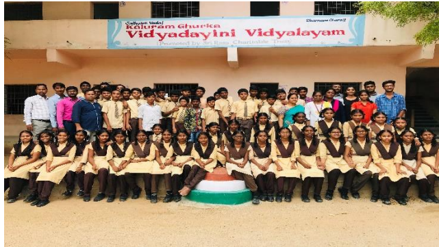
GRIETINK Outreach by ECE Department in 2 July 2019