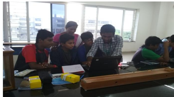
Outreach on various Electronic devices and circuitry boards