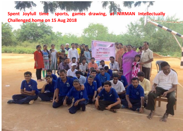
Spent Joyfull time sports, games drawing, at NIRMAN Intellectually Challenged home on 15 Aug 2018

Ashray Akruti foundation runs Special Schools with residential facilities for hearing impaired children distributed Hearing Aids, Sewing Machines for using their own creative thoughts in designing art pieces