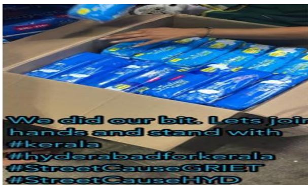
We did our bit. Lets join hands and stand with #kerala #hyderabadforkerala #StreetCauseGRIET #StreetCauseHYD

Team of Street Cause-GRIET came to the aid of Kerala flood victims especially women by giving them sanitary napkins. We took up this form of help as it was one of the major concern. We accepted donations from the team and bought 215 packets of sanitary napkins which were airlifted. Team of Street Cause-GRIET came to the aid of Srikakulam flood victims by giving them Rusk, biscuits,fruit juice packs.We took up this form of help as it was one of the major concern. We Donated 150 biscuit packets,150 rusk packets, 100 fruit juice packs.