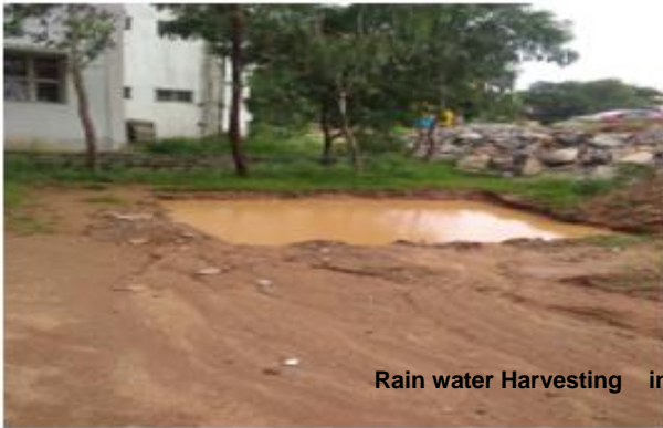
Rain water Harvesting in 15 July 2018