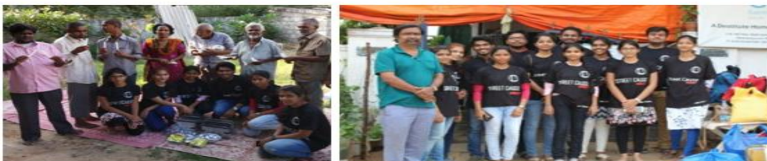
Good Samaritans – Oldage home Alwal on 14 Dec 2018