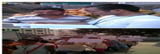
Demonetization creating an awareness to the sellers on digital economy Rally by students on 12th January 2017 at Nizampet and also at Rythubazar Miyapur, Hyd