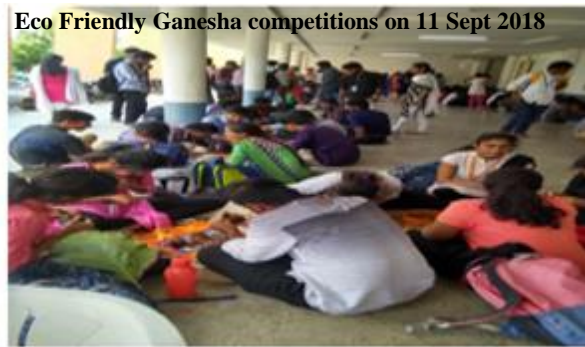
Eco Friendly Ganesha competitions on 11 Sept 2018