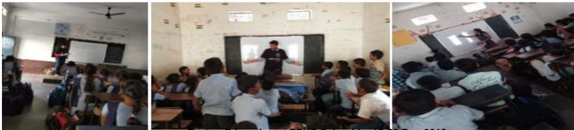
Sastra Education at ZPHS School in 12-22 Dec 2018

12. Sastra-Free Education drive was conducted by SC volunteers for the students of ZPHigh School, Nizampet: Education is very important as it helps an individual to have a better perspective of life and to become independent in life. We are taking up this event to help the school students with the subjects they are lacking either in concepts or application. We are planning to take two classes per week for a span of 2months