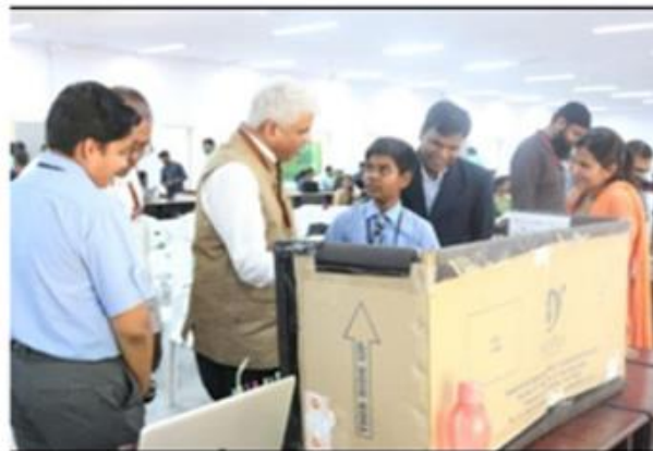
Ruedo – A National level Environment Fest in 23 Feb 2019