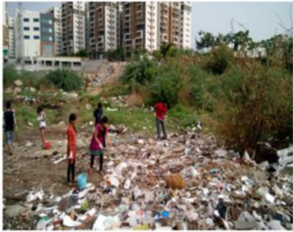
Lake cleaning at Lingam ally Lake, Madinaguda Lake, and Kapra Lake 6, 11 ,18 June 2016

7. Lake cleaning and Road Safety: Safety driving on the road precautions and safety measures through display playcards.