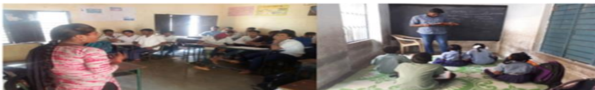
MPP School communication skills program 9 Jan 2018

5. Visiting Mandala Parishad and Govt. Schools conducted activities to improve communication skills: As Education is very important as it helps an individual to have a better perspective of life and to become independent in life. This event help school students they were lacking either in concepts or applications.