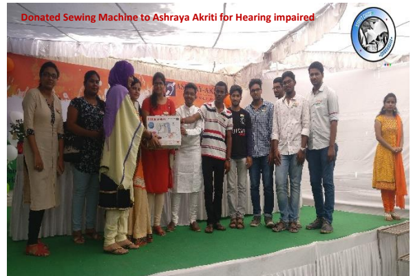
Donated Sewing Machine to Ashraya Akruti for Hearing impaired

5. Visiting Mandala Parishad and Govt. Schools conducted activities to improve communication skills: As Education is very important as it helps an individual to have a better perspective of life and to become independent in life. This event help school students they were lacking either in concepts or applications.