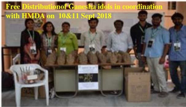
Free Distribution of Ganesha idols in coordination with HMDA on 10&11 Sept 2018