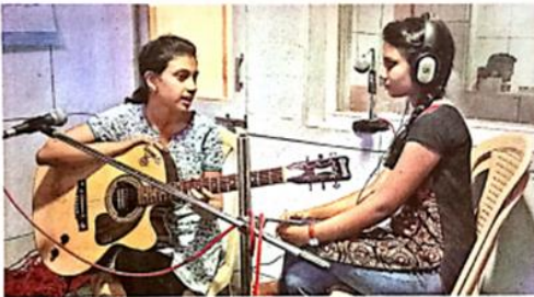
IN SYNC Students in a live session of the Francis Birl radio channel in St Francis College for Women, students performing a song on the radio channel Pragnya 90.4 FM of Gokulanga Rangaraju Institute of Engineering.