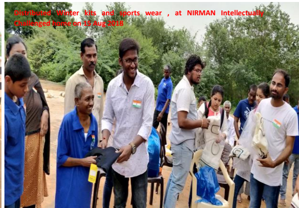
Distributed Winter kits and sports wear , at NIRMAN Intellectually Challenged home on 15 Aug 2018