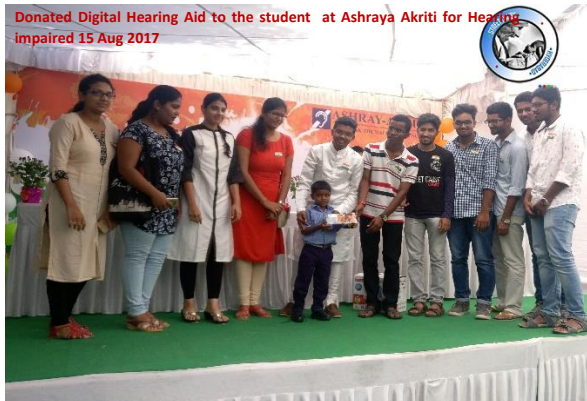
Donated Digital Hearing Aid to the student at Ashraya Akruti for Hearing impaired 15 Aug 2017