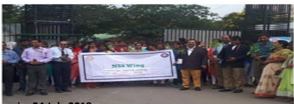
Plantation drive in 24 July 2018