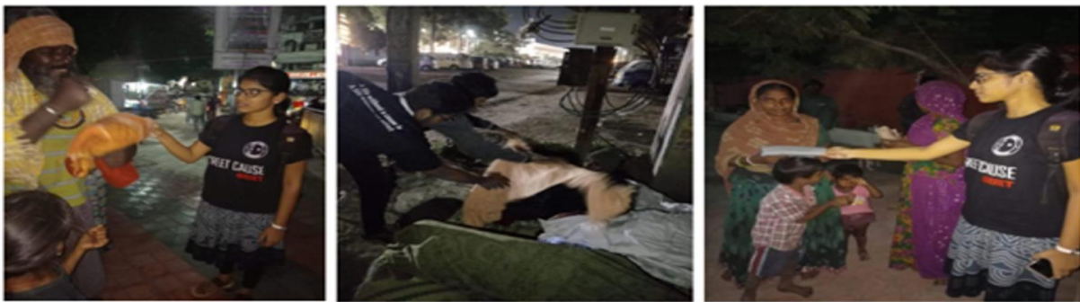
Distribution of the Blankets at the Streets of Nizampet, Miyapur on 1-15 Nov 2018

5. Restitutes during the winter season: Providing the blankets, and the needy items for the homeless during winter for the children & old people.