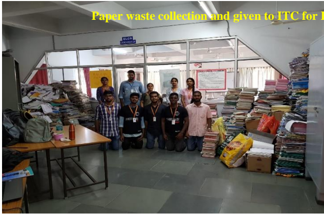
Paper waste collection and given to ITC for Recycling on 15-21 Jul 2019